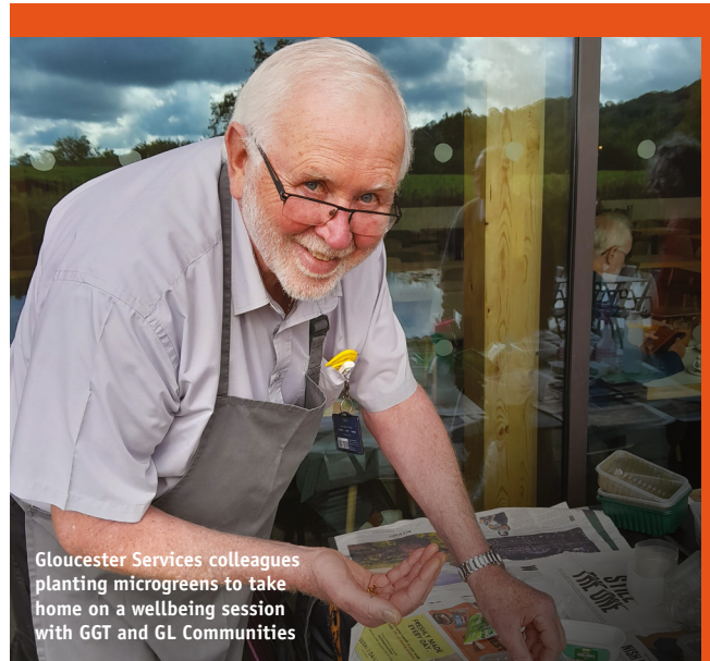
Gloucester Services colleagues planting microgreens to take home on a wellbeing session with GGT and GL Communities