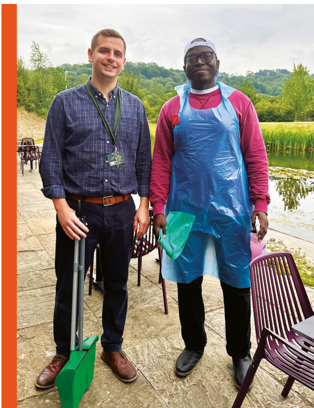
Trying out jobs at Gloucester Services on the Bridging the Gap course