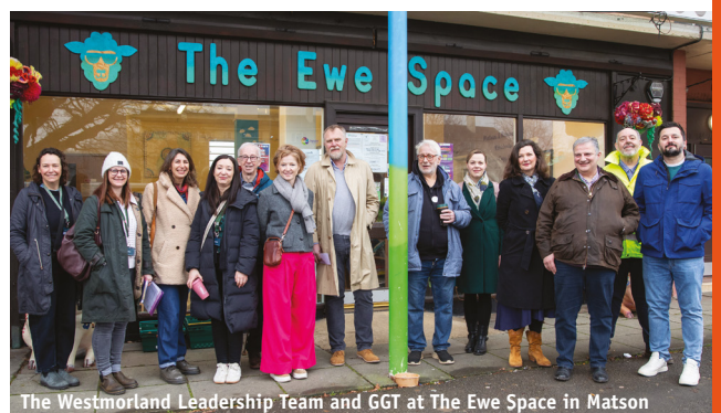
The Westmorland Leadership Team and GGT at The Ewe Space in Matson